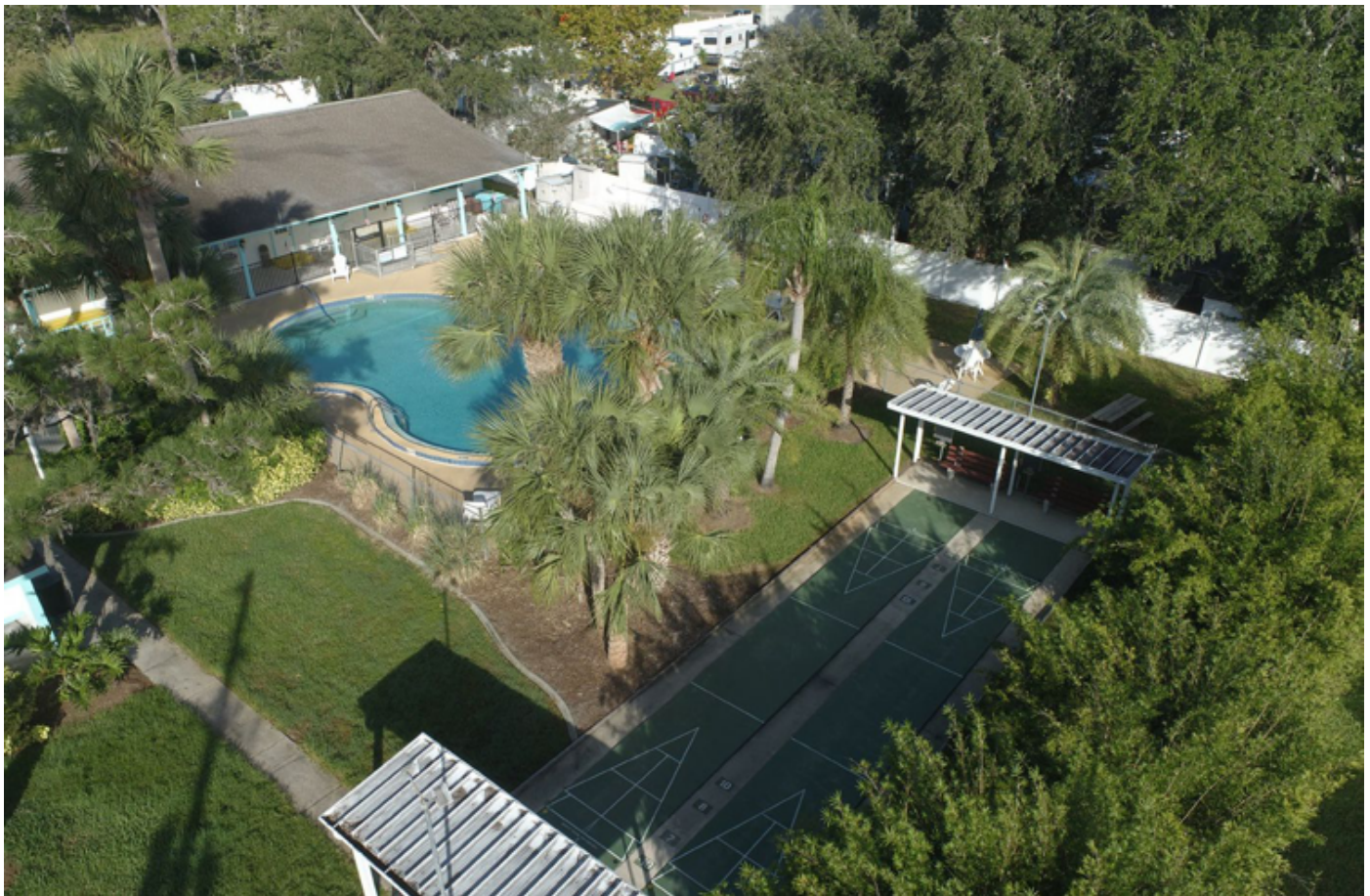
Amenities at the mobile home park include a pool, clubhouse and shuffleboard court. (Handout)

The 301-lot community is situated on approximately 61 acres of land just off Orange Blossom Trail/U.S. 17-92 and a mile from the Poinciana SunRail Station. It's next door to the 19-acre Osceola County government annex, which includes the recently completed Campbell City Tax Collector's branch . The Campbell City Annex master plan calls for a new community center and fire station.